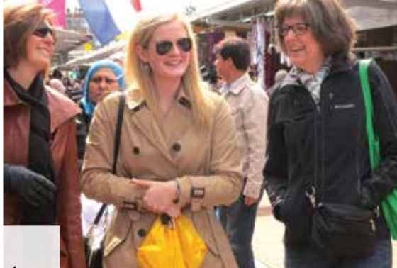
Visit to Haagse Markt