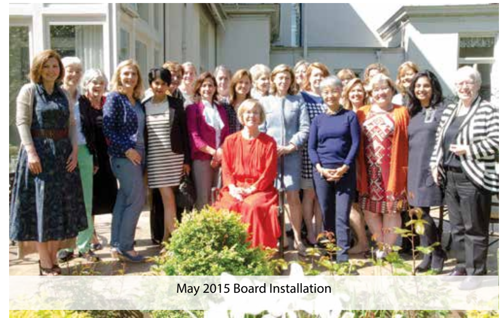
May 2015 Board Installation

Wednesday, September 9 6 – 8:30 p.m. and Thursday, September 10 10 a.m. – 2 p.m. AWC Clubhouse