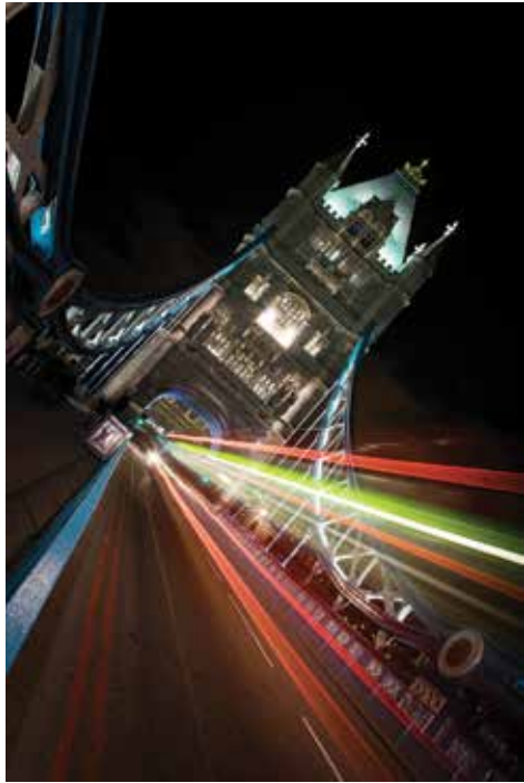
Changing the camera angle on Tower Bridge in London, England. Shutter speed - 4 seconds.