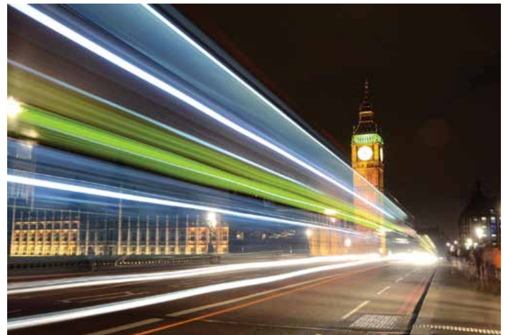
Light trails from a bus in front of Big Ben in London, England. Shutter speed- 5 seconds.