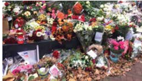
AWC Walkie Talkies brought flowers to the French Embassy in The Hague

My heart goes out to all those impacted by these horrible crimes. I feel confident that those responsible for the planning of these events will be brought to justice. In the meantime, it is sad to think that people might be having second thoughts about visiting Paris or even Europe. Of course, everyone has to