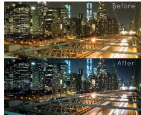
Light trails on the Brooklyn Bridge in New York City, USA. Shutter speed - 1.3 seconds.

One of the most frequent reasons for blurry night photos is camera movement. This can drastically be reduced if you use a tripod. Attach your camera to the tripod, carefully press the shutter release button and then do not touch the camera again until the photo has finished being taken. To further reduce any camera shake, you can use a remote to take the photo so as to avoid touching the camera at all. You don’t have to worry about lugging around a bulky tripod, as there are many foldable ones that are perfect for travelling!