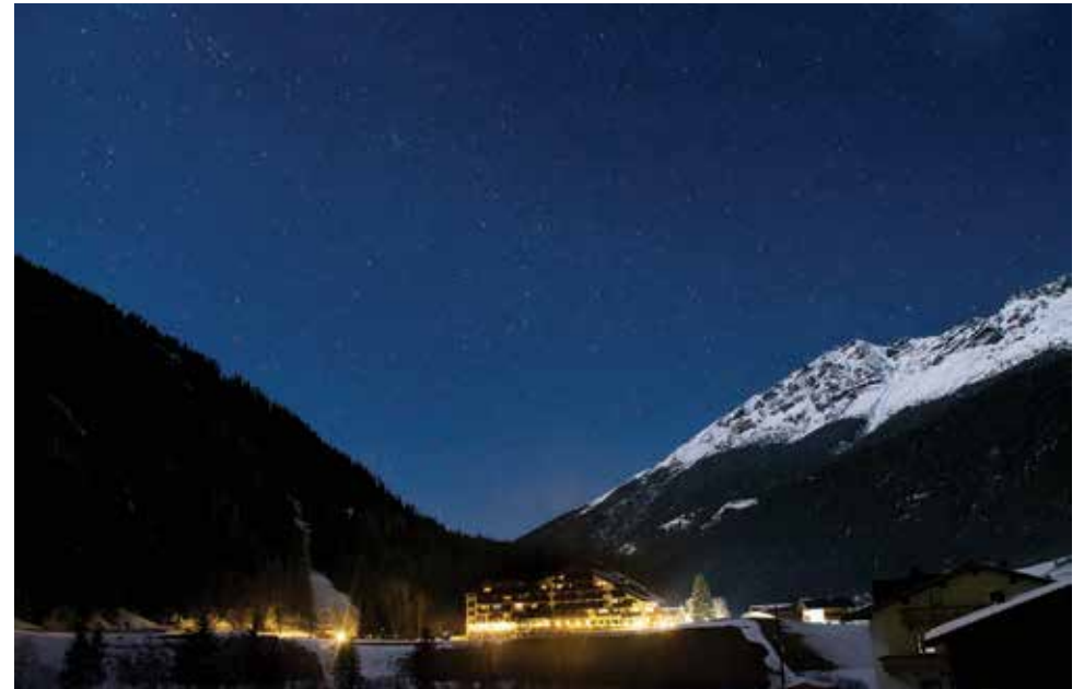
One of my coldest nighttime photo safaris in the mountains of Austria in February. Shutter speed - 30 seconds.