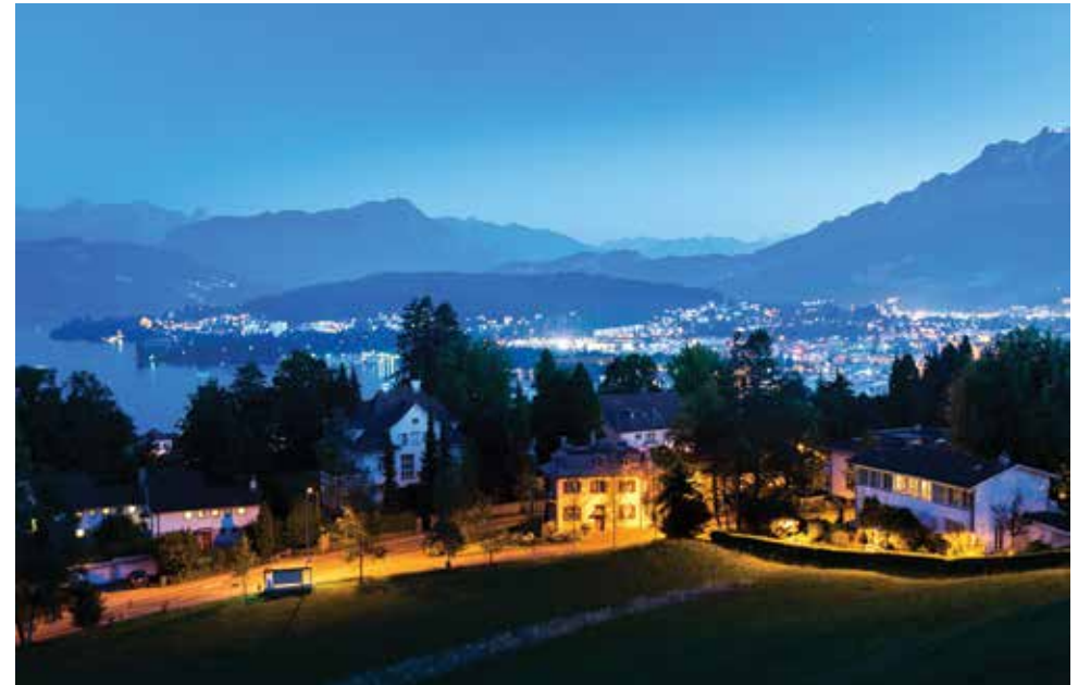
Looking out over the city of Lucerne, Switzerland just after dusk. Shutter speed - 10 seconds.