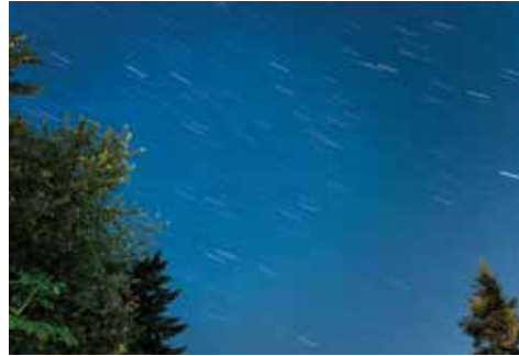
Star trails in the dark skies of Zakopane, Poland. Shutter speed - 11 minutes.

When I go out to shoot at night, I always make sure I bring along a flashlight for two main reasons. First, having a flashlight handy