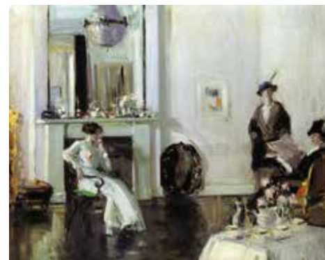
Afternoon by Francis Cadell, 1913